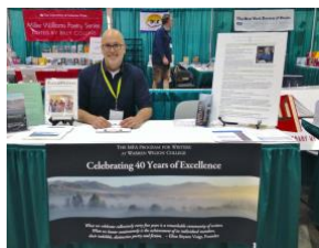
Los Angeles 2016