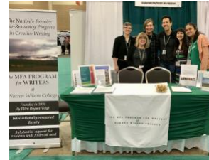
San Antonio 2020